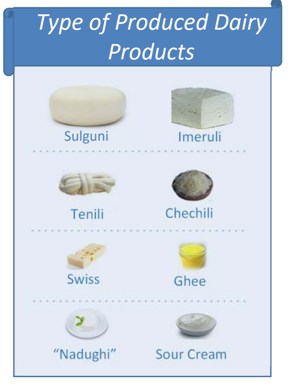
Figure 3. Diversified dairy product

Crowding in entities are understanding the value of FS&H for their business. All the crowding in entities are oriented on the quality of dairy products, they source raw milk from small livestock producers and are trying to fulfill all the FS&H requirements and establish HACCP. 60% of them are funded by the government grants and actively working with them and 40% cooperate with the ALCP clients, CNFA , USAID or to get information/funds to fulfill FS&H requirements and further establish HACCP.