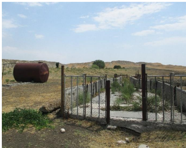
Private bath in Dedoplistskaro municipality, Kakheti region