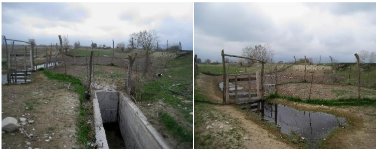
Private bath in Khorkheli Village, Akhmeta municipality, Kakheti region