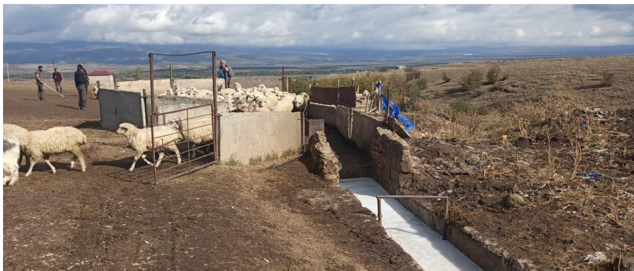
A private sheep bath in Iormuganlo Village, Sagarejo municipality, Kakheti region